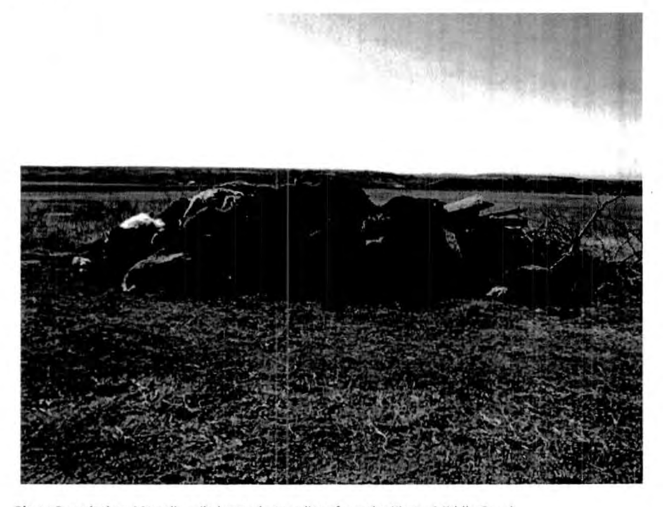
Photo Description: Mortality pile located upgradient from the Kinsey Middle Canal.