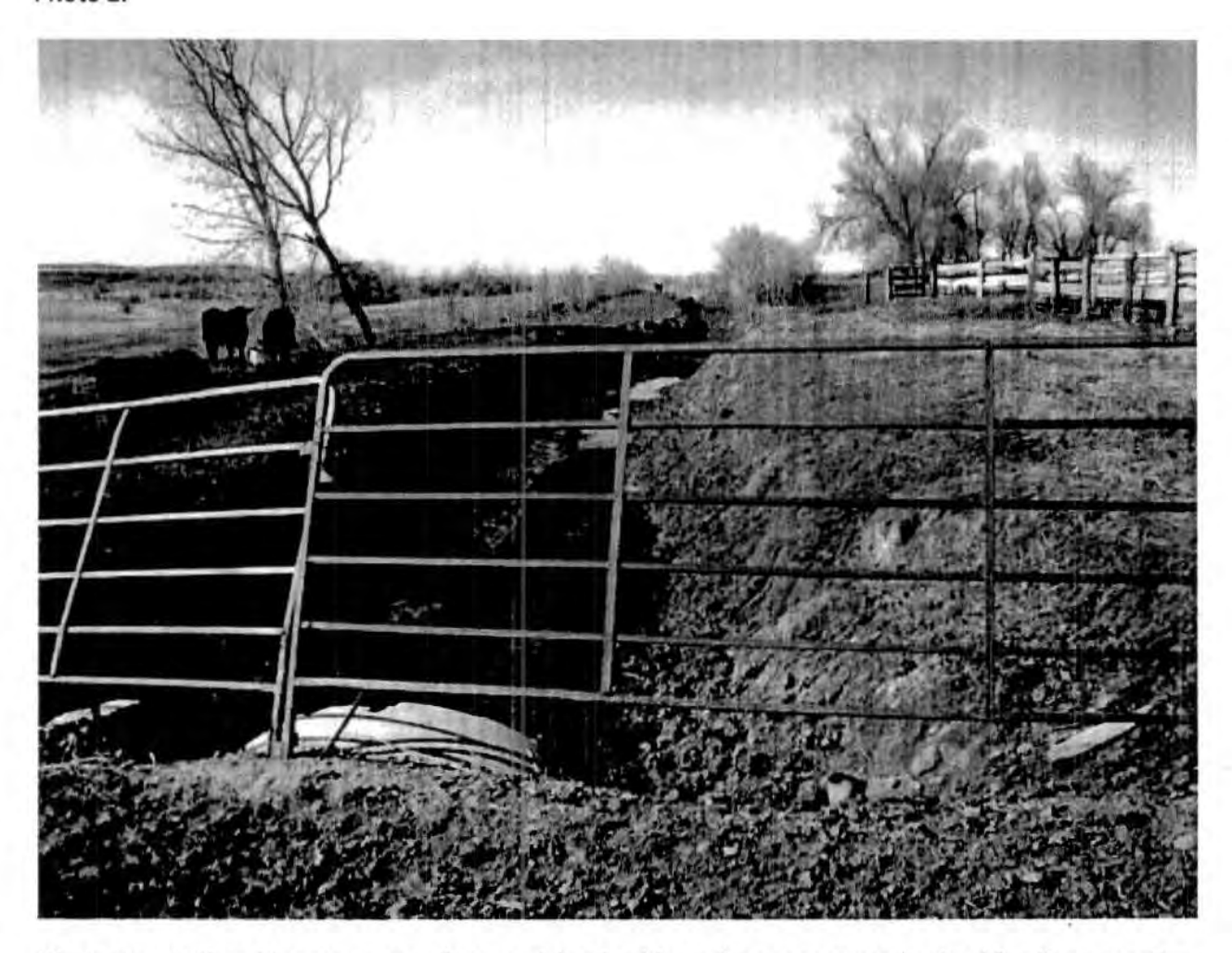
Photo Description: Manure, waste silage, and / or feed from the concentrated animal feeding operation pens along the northern border of the facility and the animals within the confinement pen is shown within the Kinsey Middle Canal.