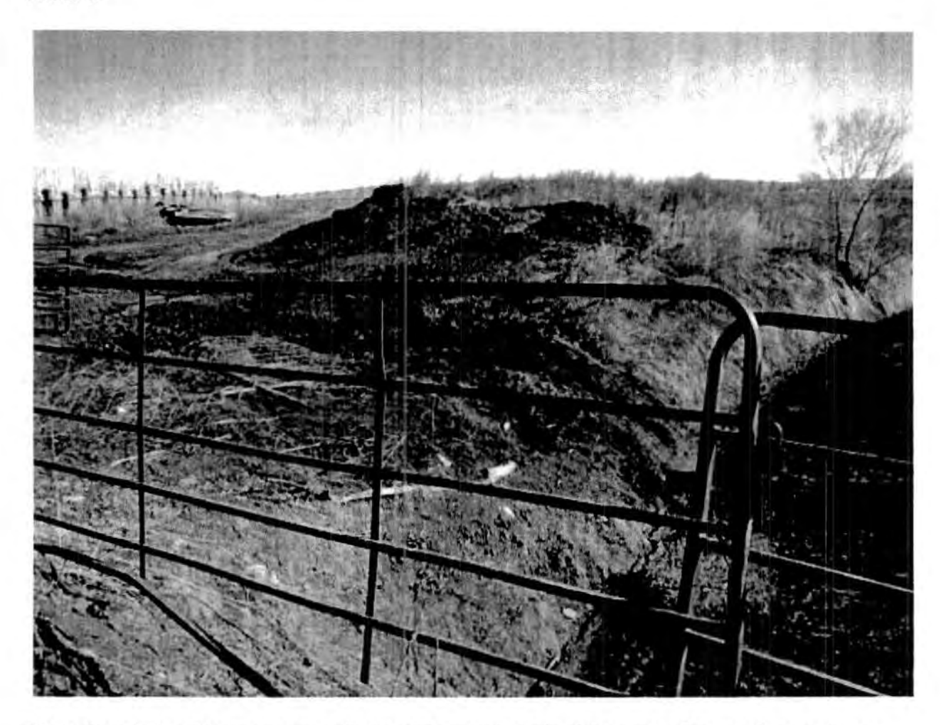
Photo Description: Manure storage pile located approximately 40 feet east of the confinement pens along the northern border of the facility. Manure, waste silage, and / or feed is shown within the Kinsey Middle Canal.